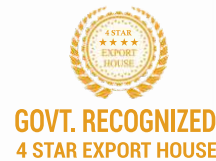
4 STAR EXPORT HOUSE