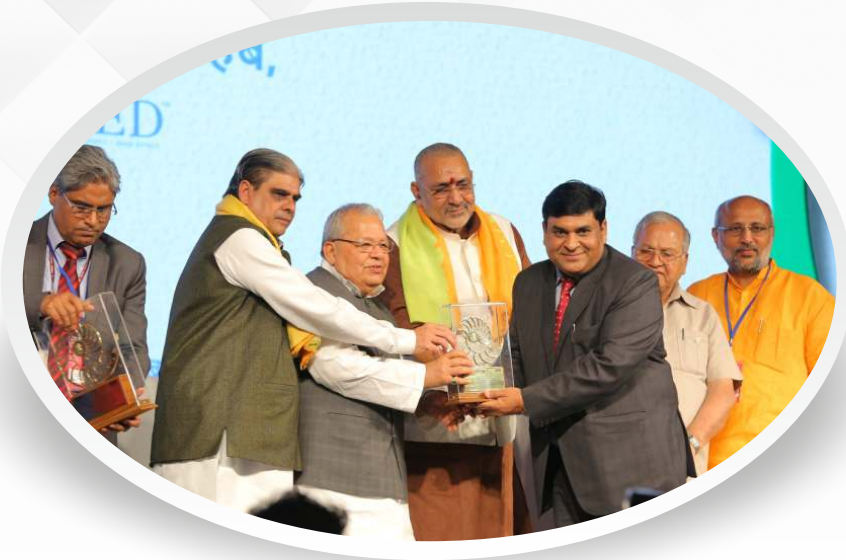
MSME Award , 2013 & 2014 (From the Hon'ble Minister of Micro, Small and Medium Enterprises, Sh. Kalraj Mishra, in the presence of Hon'ble Prime Minister, Sh. Narendra Modi.