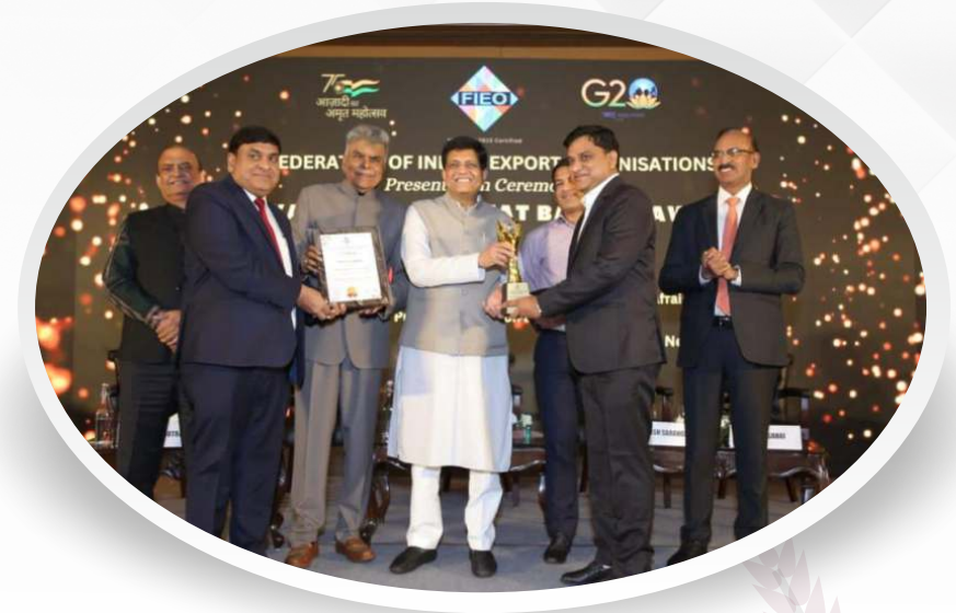
Niryat Shree Award , 2023 (From the Hon'ble Union Minister of Commerce & Industry, Sh. Piyush Goyal.