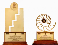
MSME 2013 & 2014 (Recg. by Govt. of India)