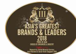
ASIA'S GREATEST BRANDS & LEADERS